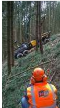
Steep terrain in Alsace