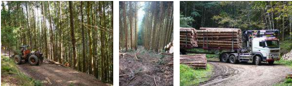
The rest of the site was harvested with motor-manual equipment and logs were hauled on the roadside with a skidder