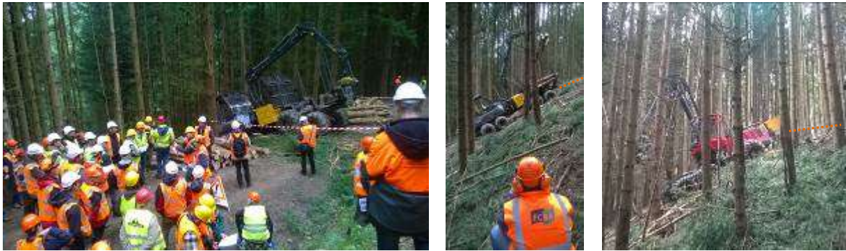
Parts of the logging site were operated with a harvester and a forwarder both equipped with a synchronised winch from AFICOR installed on the machines as an add-on for steep terrain

At the forest road side, transport was also discussed, emphasizing modern practices for material and information flows implemented in the area.