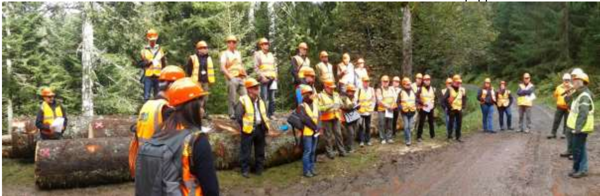
Long logs were hauled to the road side with a grapple skidder also equipped with a cable