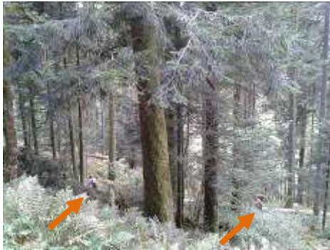
Large diameter in multifunctional environment

On this itinerary, 140 participants were invited to discover aspects of the local value chain in sub-mountainous environment at three different locations.