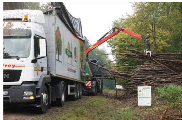
This truck is used both by ONF ENergie and Forêts et Bois de l'Est "Sylvowatts" for the deliveries of the wood chips