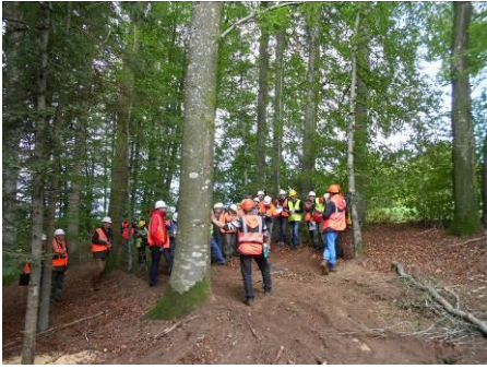
Preliminary estimation on standing trees

assortment ensures value creation through supply of the different consumers: sawmills, panel factories and local fuel wood consumers. The process for delivering the right logs for the right value chain was illustrated with beech and oak. Industrial specifications for round wood are taken into account for the actual bucking of the log by the supplier in order to fulfil the different contracts.