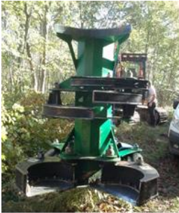
Bioenergy and collaborative logistics

On this itinerary, 70 participants were invited to discover aspects of the local value chains at three different locations.