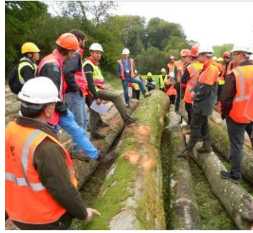
Round wood assortments according to clients' specifications regarding dimensions and singularities