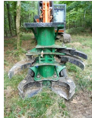
The shear heads C360 (Jacquier's red) and S350 (Seve's green) mounted on excavators were demonstrated on site in an oak stand