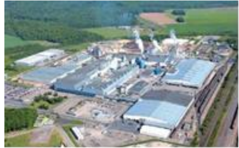
Norske Skog Golbey & Pavatex in the "Green valley"