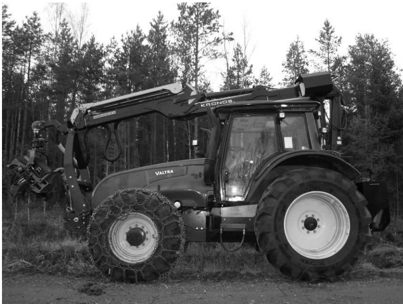
Figure 1. Forestry-equipped Valtra T171 peat harvesting tractor.

The tractor harvester's ability to operate was good where terrain and ground surface was easy (flat) and there were no interruptions caused by machine breakdowns. Moreover, the harvesting quality met the recommended standards. The results indicate that the productivity of the Valtra T171 tractor-based harvester and the Nisula 400C harvester head was at the same level as that of conventional small and medium-sized wheeled harvesters in previous studies during the last ten years in Finland. Cutting productivity per effective hour (m 3 /E 0 h) increased as the trees' stem volume grew, with a stem volume of 50-200 litres and a harvesting intensity of 737-368 trees per hectare, a cutting productivity of 8.0-19.1 m 3 /E 0 h