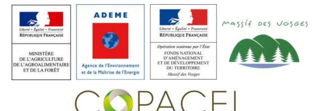
Union Française des Industries des Cartons, Papiers et Celluloses

FCBA is thankful of the support of the financial partners of the conference, namely the French ministry for agriculture and forestry (<u>MAAF</u>), the French Environment and Energy Management Agency (<u>ADEME</u>), the commissariat de massif Vosges and the association of French Paper Industries (<u>COPACEL</u>)